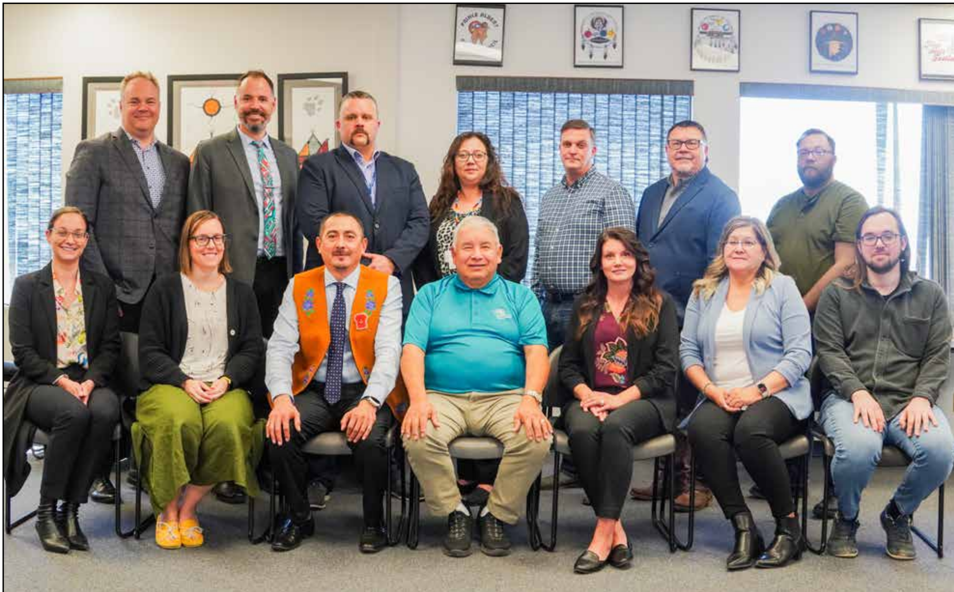
Ron Merasty Photo